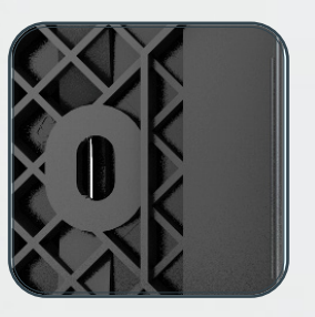
Robust honeycomb integral support structure increase the strength of the bracket to prevent deflection