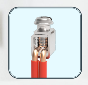
M4 screw with folded terminal suitable for 2 x 4mm<sup>2</sup> cables