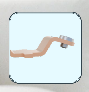
99.7% copper alloy bridge ensure excellent corrosion resistance and electrical / heat conductivity