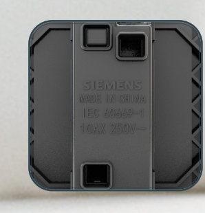
IEC Certified and applicable to LED load