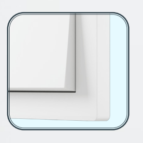
Angled edges with simple curved dolly for soft switching