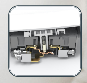
Reverse bridge design, can effectively reduce arcing, and improve the switch with longer service life.