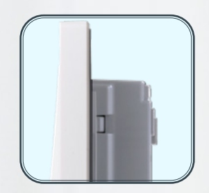
Slim 8.2mm thickness that seemlessly blends into paint or wallpaper