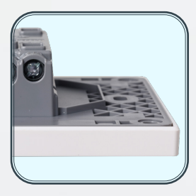
Tapered edges for easy installation and dismantling