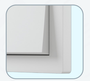
Angled edges with simple curved dolly for soft switching