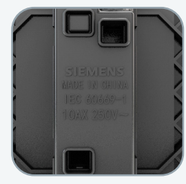
IEC Certified and applicable to LED load