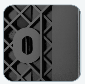
Robust honeycomb integral support structure increase the strength of the bracket to prevent deflection