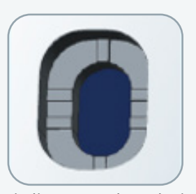
Anti-slip screw shoe design to prevent loosening and more reliable during installation