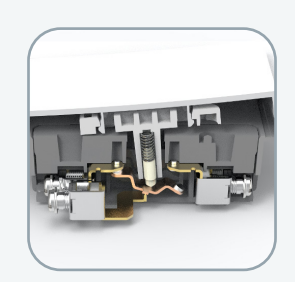
Reverse bridge design, can effectively reduce arcing, and improve the switch with longer service life.