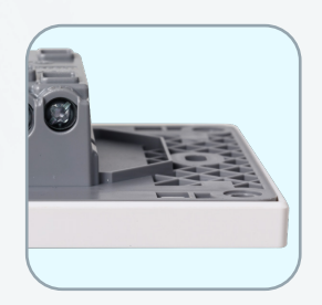
Tapered edges for easy installation and dismantling